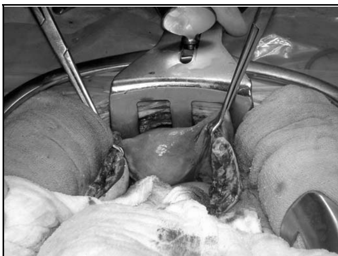
Figure 2. Bilateral ovarian wedge resection along the affected ovarian stroma was made at the staging laparotomy.

As the present case report, several case reports and the results of recent case-control studies have raised questions about potential neoplastic effects of ovulation induction agents used as anovulatory infertility treatment. Rossing MA et al detected 11 ovarian tumours in a cohort of 3837 infertile women and found that relative risk for ovarian cancer in such group of women was 11.1 with 95% confidence interval versus 1.5 with 82.3% confidence interval in the control cohort who did not received ovulation induction therapies. They also concluded that prolonged use of ovulation induction agents might increase the risk of ovarian neoplasm. 1