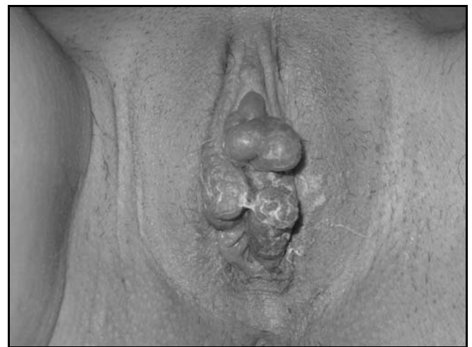
Figure 1. Fibroepithelial sessile vulvar polyps with fissured surfaces.

Macroscopic features: The lesions ranged in size from 1 to 4 cm in maximum dimension. The fresh specimen was described as polypoid or pedunculated in appearance which had either smooth or fissured surfaces. The cut surface was oedematous, uniform and soft. They were described as multipl cysts that were gelatinous in appearance (Figure 1).