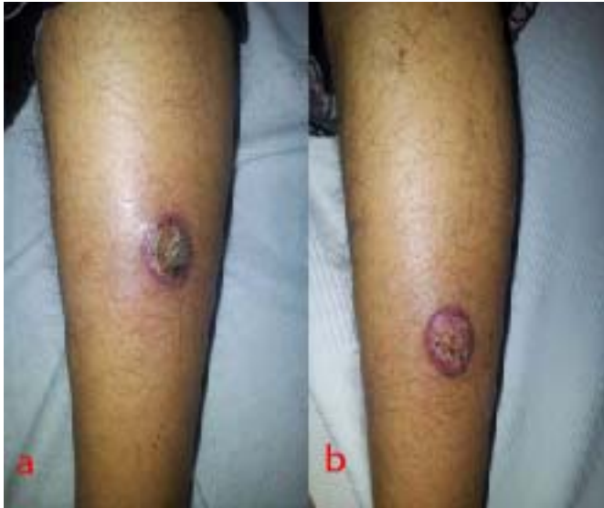
Figure 1: Photograph of the lesion a) before, b) after one week treatment.