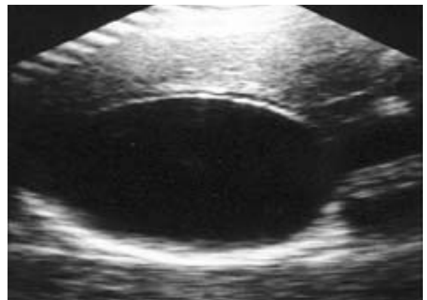
Figure 1: Ultrasonographic image of the hepatic hydatid cyst

in her 21st week of pregnancy due to regurgitation, heartburn and chronic cough. Ultrasonographic and computed tomography imaging revealed that a 7×5×6 cm, echo-free multilocular cystic mass in the liver. (Figure 1) The diagnosis of hydatid disease was confirmed by an indirect hemagglutination test. Laboratory tests were all within normal limits. The uterus size was appropriate for the gestational age of 21 weeks and it contained a single viable fetus. The treatment options were elucidated to the patient and relevant and they refused all, including percutaneous drainage, laparotomy surgery and medical treatment during pregnancy. In the 39 th week of pregnancy cesarean section was performed because of her previous sections. At laparotomy the hepatic cysts were removed. (Figure 2) No postoperative complications occurred.