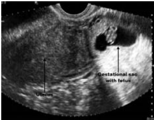
Figure 1. Transvaginal ultrasonography showing right tubal gestational sac involving fetus with a gestational age of 7 weeks and 6 days (crown-rump length of the fetus was 14 mm)

tion confirmed preoperative diagnosis (Figure 3). However, recanalization or fistula could not be demonstrated microscopically. The patient was discharged from hospital after an uneventful postoperative course of 24 hours and she is free of any symptoms 6 weeks after the operation.