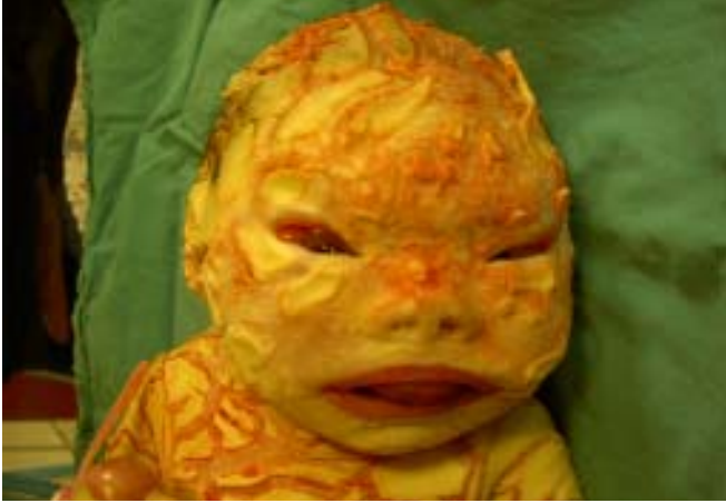
Figure 2: facial features of HI