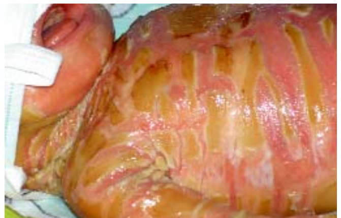
Figure 4: skin lesions after ten days

In conclusion we summarized this case to emphasize that HI is a very rare disease which is hard to diagnose prenatally even with regular prenatal visits and ultrasound examinations.