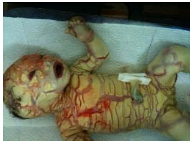
Figure 1: skin features of HI

there were fissures and map like plates on fetal head skin. Limited ultrasonographic examination (amniotic fluid index, fetal biometry, fetal cardiac activity, fetal presentation, placental position was noted) was normal except polyhydramnios. Prepartum diagnosis of this condition could not be made. Fetus was externally monitored. At the 15 th minute of NST examination, late decelerations and abnormal vaginal bleeding began. Patient was delivered with cesarean section and a baby was born with harlequin ichthyosis. The female baby was born alive at the 36 th week of the mother's third pregnancy, her birth weight was 3000g and her length was 50 cm. Baby was handed over to paediatrician. It was covered with thick, hard armour like plates of cornified skin separated by deep fissures (figure 1). The infant had characteristic features typical for HI; ectropion, eclabion, a distorted, flattened nose and low set dysplastic ears (figure 2). There was flexion deformity of all joints of the limbs (figure 3).