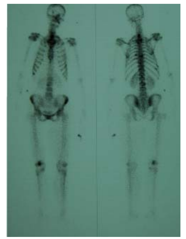
Figure 2: Bone scans shows diffuse, mild increased uptake in the T1-T4, T8 vertebrae and posterior aspect of right 9<sup>th</sup>-11<sup>th</sup> ribs, probably bone

tial diagnosis.11 A similar case of EOC metastatic to spine presenting with paraparesis described by Wuntkal et al in a postmenopausal woman. The patient was treated with radiotherapy and dexamethasone, but died within a month.12 In our case, the patient had no prenatal care and her complaints were attributed to pregnancy. Her neurologic symptoms had showed a very rapid progression and she had complete paralysis of lower extremities, before her first admission to our clinic. After delivery, our patient was managed with a combined therapeutic approach, including cytoreductive surgery, chemotherapy and palliative radiotherapy to dorsal spine. However the patient died within 5 months.