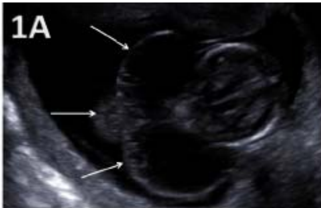
Figure 1A: Ultrasound examination and macroscopic features of the affected fetus A: White arrows indicating septated cystic hygroma behind the neck of the fetus

tuses, a work up was performed. Classical mutations for thrombophilia were normal but her homocysteine level was high. The parents were not related. Karyotype analyses of both of them were proved normal. There was no family history of any chromosomal abnormality. During the initial ultrasound assesment at 8 weeks of gestation, vanished twin phenomenon was noted. At 14 weeks; a large, septated cystic hygroma and fetal hydrops detected (Figures 1A and 1B). After genetic counselling the parents elected to have a fetal karyotype and CVS performed. Karyotype analysis revealed the result of monosomy X. The parents decided to terminate the pregnancy and after termination of pregnancy, cystic hygroma behind the neck of the fetus was observed (Figure 1C).