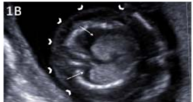
Figure 1B: Arrowheads indicating skin edema and the arrows indicating pleural effusion