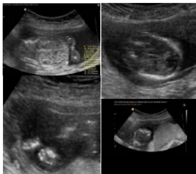
Figure 1A,B,C,D: Bilateral polycystic kidneys (A), ventriculomegaly (B), polydactyly (C), encephalocele (D)

In her ostetric follow up, first trimester Down syndrome screening test had been performed at another center and had revealed increased risk (1/199) of Down syndrome. Further investigation tests for karyotyping (cordocentesis, amniocentesis) were offered but patient denied. Detailed ultrasonographic examination revealed bilateral polycystic kidneys, ventriculomegaly, encephalocele and polydactyly (Figure 1). The family was counseled for recurrent MGS and a termination of pregnancy was carried out at the 16 th week of the pregnancy.