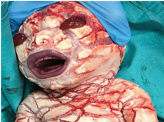
Figure 3: Postpartum image

The epidermis of all newborns had erythrodermic edema, characterized by the presence of greasy, thick scales resembling vernix caseosa (Figure 3). The histological examination results of fetal skin biopsies for cases 2, 3, and 4 exhibited consistent findings indicative of epidermolytic HI, thereby confirming the diagnosis of HI. The histological diagnosis for the remaining two patients was inconclusive. Case 1 was discharged after being followed in NICU for 55 days, cases 2 and 3 for 40 days, case 4 for 70 days, and case 5 for 90 days in NICU. Although all cases are alive, they are followed by a multidisciplinary team consisting of dermatology, ophthalmology, and pediatric specialists, according to telephone communication with the families.