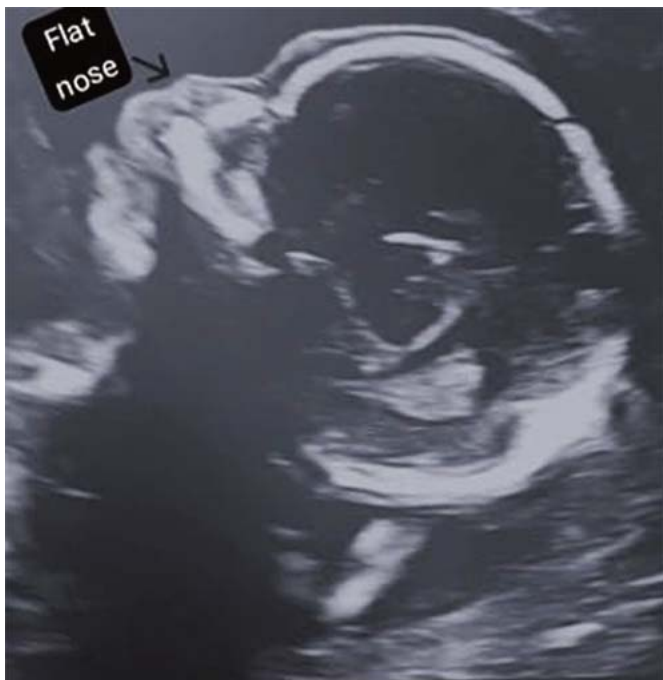
Figure 1b: 2D USG image, flat nose