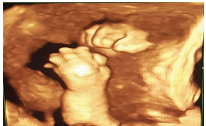
Figure 2b: 3D USG image, swelling of the fingers