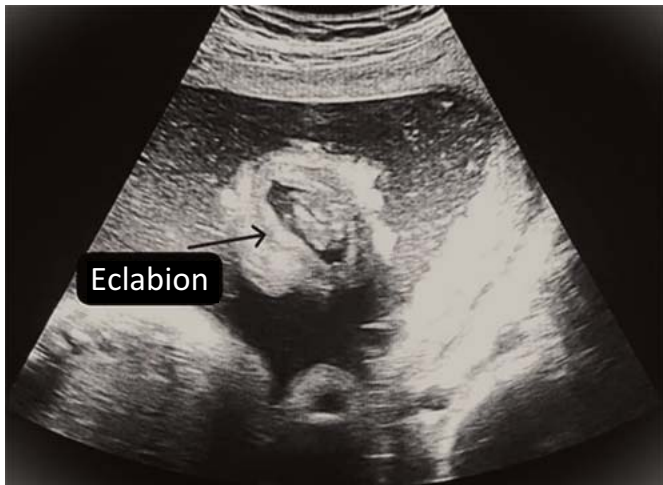
Figure 1a: 2D USG image, eclabion

served in the fingertips, accompanied by a significant increase in the curvature of the distal digital pulp, resulting in the disappearance of the nail (Figures 1c and 2b).