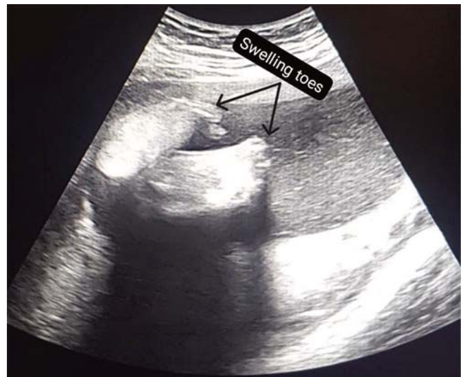
Figure 1c: 2D USG image, swelling toes