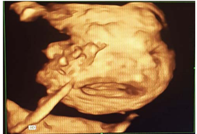
Figure 2a: 3D USG image, fetal face