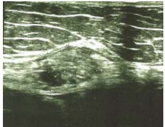
Figure 1: A 21x14 mm heterogen hypoechoic and semisolid mass with internal echoes 15 mm deep from the skin

After the approval of the patient total excision of the mass followed by a fine needle biopsy both under local anesthesia without damaging the rectus abdominis muscle was performed. Preoperative and postoperative histopathological examination of the resected mass was endometriosis (Figure 2).