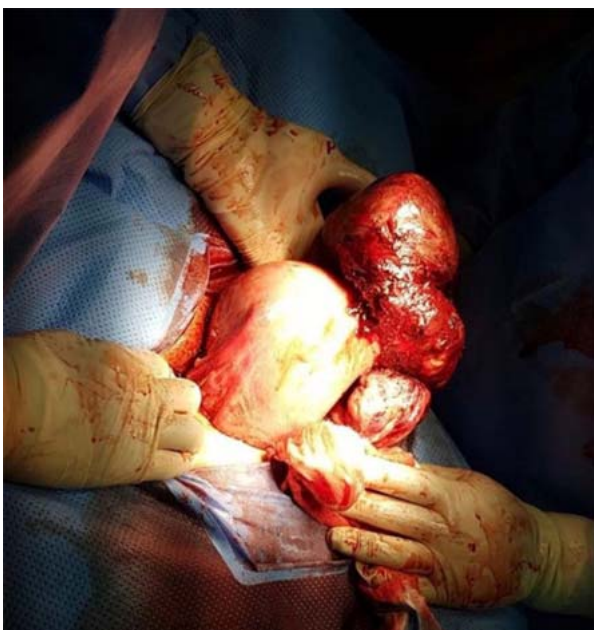
Figure 2: Intra-operative left-sided ruptured subserous myoma with attached hematoma

Histopathology grossly described a hemorrhagic fragmented whitish-deep brown tissue measuring 15×14×10 cm. Cut sections show a whitish hemorrhagic surface and hematoma. Microscopically, the cut sections show a vascularized tumor with attached hematoma; the mass is mainly composed of interlacing smooth muscle fascicles (Figure 3) with mitosis less than 1/10HPF with areas of myxomatous changes and symplastic-like cells. Blood vessels were numerous, of variable sizes, and had remarkable endothelial lining (Figure 4).