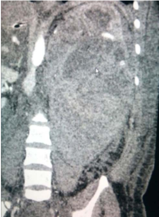
Figure 1: CT scan of abdomen