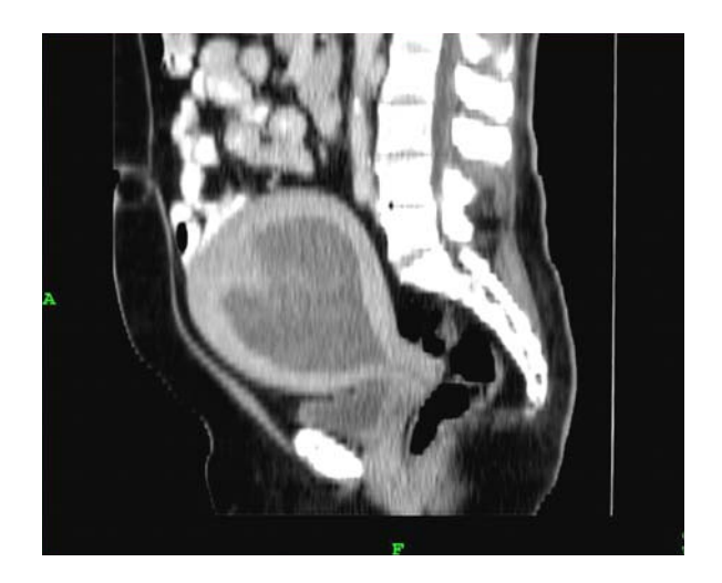
Figure 1. CT scan reveals an enlarged uterus with thickened walls and hematometra in which heterogeneous appearance is present (sagittal view).

Suprapubic and transvaginal ultrasound confirmed the finding of an 18 x16 x 14 cm mass containing heterogeneous echogenic material, presumably a blood clot in uterine cavity, and normal postmenopausal ovaries. There was no ascites. Following ultrasonography, abdominal and pelvic CT, MRI were performed to better delineate hematometra and for staging purpose of possible diagnosis of endometrial carcinoma (Figure 1-3). The uterus was found to be enlarged with thickened walls and filled with heterogeneous fluid (hematometra) and the diagnosis of cervical stenosis was confirmed by pelvic CT and MRI.