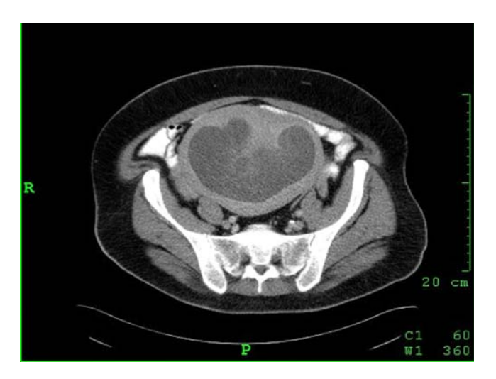
Figure 2. CT scan reveals an enlarged uterus with thickened walls and hematometra in which heterogeneous appearance is present (axial view).