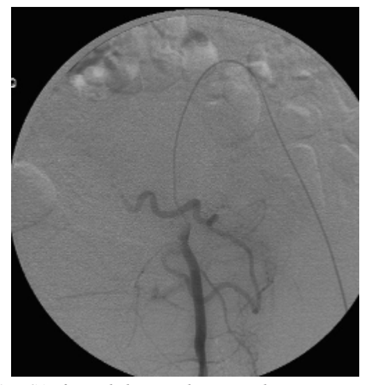
Figure 3: DSA after embolization shows complete treatment of active extravazastions and abnormal vascularization