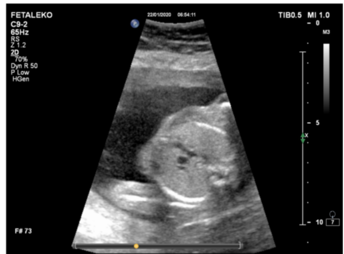
Figure 2: A case of Tetralogy of Fallot with a diameter of ascending aorta larger than a diameter of the main pulmonary artery on the three-vessel view

Mean maternal age at the time of evaluation was 30 \pm 4.0 years, median gravidity was 2 and parity was 1. Four cases were multiple pregnancies and 7 pregnancies were achieved by assisted reproductive technologies. The double test was performed to twelve pregnant at first-trimester; all had a low risk for chromosomal anomalies except one. This case had a high risk and was diagnosed trisomy 21 by chorionic villus sampling later. Nine cases didn't prefer to take any tests. The mean gestational week of diagnosis was 20.5 \pm 0.5 weeks. Cesarean section was performed in 18 pregnancies. Mean birth weight was 2638 \pm 662.7 grams and mean gestational age at delivery was 36.6 \pm 3.0 weeks of gestation. First minute Apgar score was below 7 in 5 infants and 11 infants were admitted to the neonatal intensive care unit. A pediatrician evaluated all the neonates at birth. Postnatal echocardiography was applied to all newborns before their discharge from the hospital.