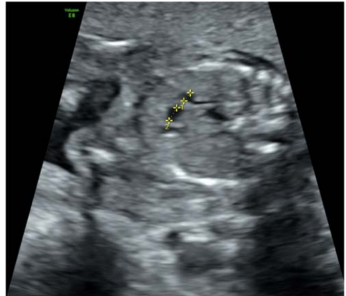
Figure 1: Three vessel view shows that a diameter of ascending aorta larger than a diameter of the main pulmonary artery (1=main pulmonary artery, 2=ascending aorta)

As a result of obstetric ultrasonographic measurements, there were 21 fetuses (0.55%) with AA larger than MPA ( AA/MPA > 1 ). Major CHD was observed in 10 of them (47.6%). Figures 1 and 2 show the cases with the larger AA than MPA on 3VV. Mean sizes of AA, MPA sizes and AA/MPA ratios were detected as 3.6 \pm 1.05 mm, 3 \pm 0.97 mm and 1.2 \pm 0.11 , respectively. Cases in which ascending aorta was larger than MPA on 3VV are shown in Table I. The highest AA/MPA ratio (1.4) belongs to the case with double outlet right ventricle and pulmonary valve stenosis (DORV-PS).